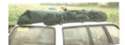
Two tents in cases

Tents can be manufactured with your company logo or slogan screen printed on the sides.